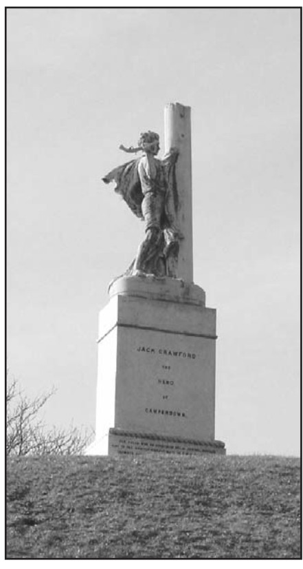
Statue of Jack Crawford in Mowbray Park

During the fierce fighting, HMS Venerable was badly damaged and the main mast was broken. Jack Crawford climbed the broken mast and nailed the flag to it, whilst under heavy fire. The Union Flag (the original Union Jack without the red saltire of St Patrick) was the command flag of Admiral of the Fleet. In a time without electronic communication systems this flag was a very important identifier, and a proud symbol of British power. The loss of the flag could be a great blow to morale and could affect a battle. The phrases to "nail your colours to the mast" and "show your true colours" refer back to the original use and meaning of these flags.