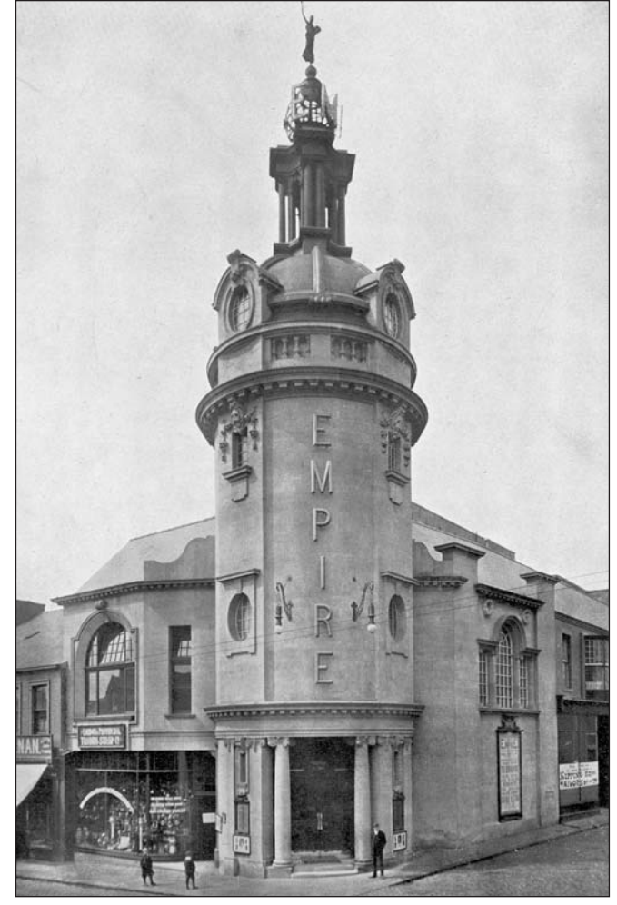
The original Sunderland Empire

well-to-do customers, but as music hall was for all classes, the working-class families had their own entrances. These were on the side street with their own pay-box; a small arched hatch set in the wall. Buskers entertained customers as they queued outside, attended by hot potato & roast chestnut vendors.