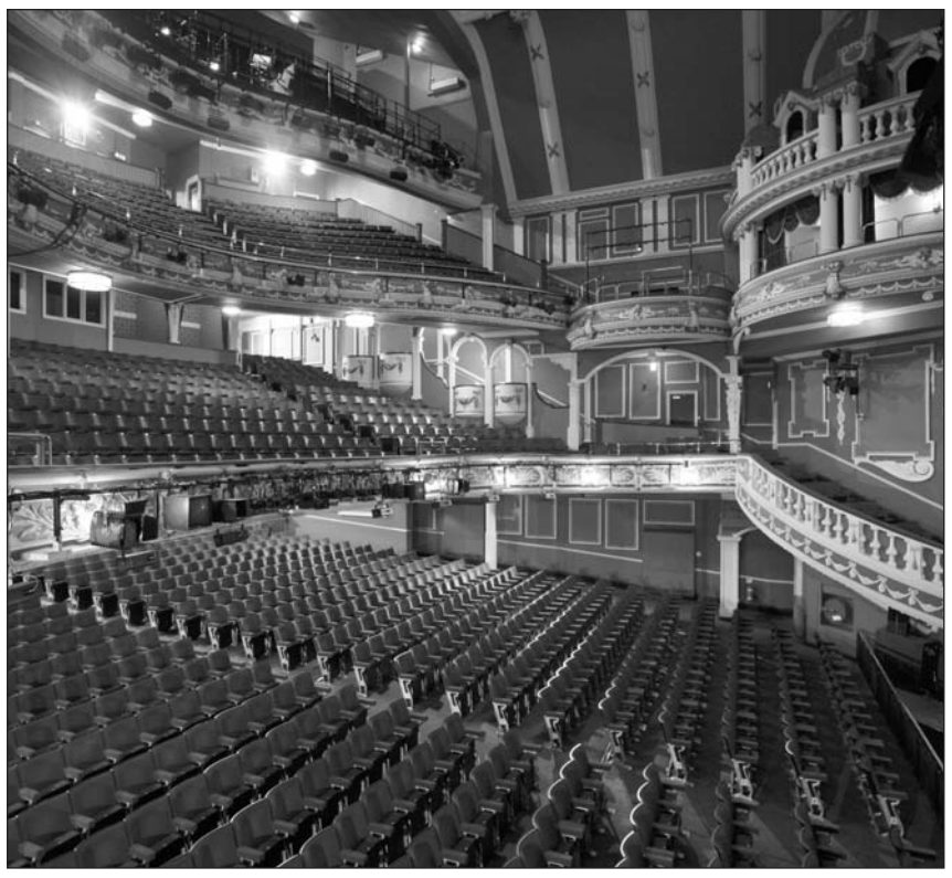
The interior of the Empire today

Sunderland Corporation took the unprecedented step of buying the theatre for \pm 50,000 and it became the first "number one" theatre under civic control in the U.K.