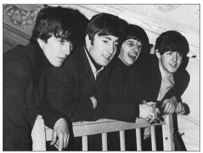
The Beatles prior to their 2nd performance at the Empire on Saturday 30 November 1963

round tower crowned with a dome and a revolving sphere which bore the statue of "Terpsichore" the Greek Goddess of dance, not as is commonly thought, Vesta Tilley. Shortly after the beginning of the 2nd World War a bomb fell nearby, badly rocking the building so the globe and statue were removed for safety. The original statue can still be seen in the hallway of the theatre and a replica stands at the top of the dome. The grand main entrance was for