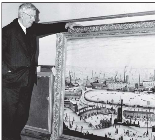
L S Lowry at Sunderland Museum & Art Gallery in August 1966

Sunderland Museum & Winter Gardens house a collection of Lowry paintings, some of which are on display in the Art Gallery.