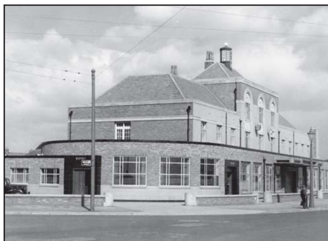
Seaburn Hotel in about 1960

Lowry's first known visits to North East England were in the mid-1930s, when he started to visit Berwick-upon-Tweed. He liked the town so much that he regularly returned, and even considered buying a house there in the late 1940s. After his retirement in 1952, Lowry's association with the North East continued to grow. The region became a retreat from the pressures of his success, and provided him with a rich source of subjects for his work: buildings, coast, sea and shipping. Travelling down from Tyneside in 1960, Lowry discovered Sunderland by what he described as chance, and this started a long and close relationship with the town. Over the next fifteen years he spent much time in the North East, using Sunderland as a base for exploring the region. Lowry always stayed in room 104 at the Seaburn Hotel (now the Marriott), except on rare occasions when the room was not available. Separated from the beach only by a road and promenade, Lowry could look directly out over the North Sea from his bedroom and from the dining room where he always sat at the same table, next to the window. The North Sea fascinated him and he would spend hours walking along the sea front. Fascinated by monuments, Lowry was interested in Bede's Cross, which he saw when walking towards Roker. This monument had been erected in 1904 in memory of the Venerable Bede.