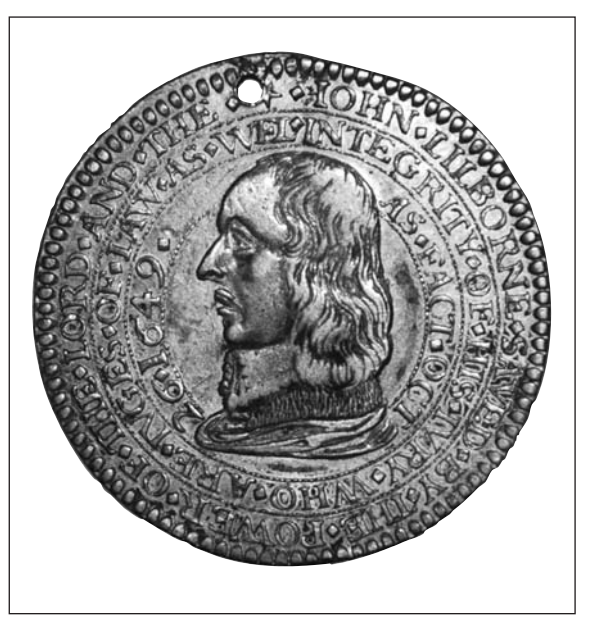
Commemorative medal 1649 - Sunderland Museum & Winter Garden.

In July 1646, he was imprisoned in the Tower of London for denouncing his former commander the Earl of Manchester as a traitor and Royalist sympathiser. It was the campaign to free him from prison which spawned the political party called the Levellers.