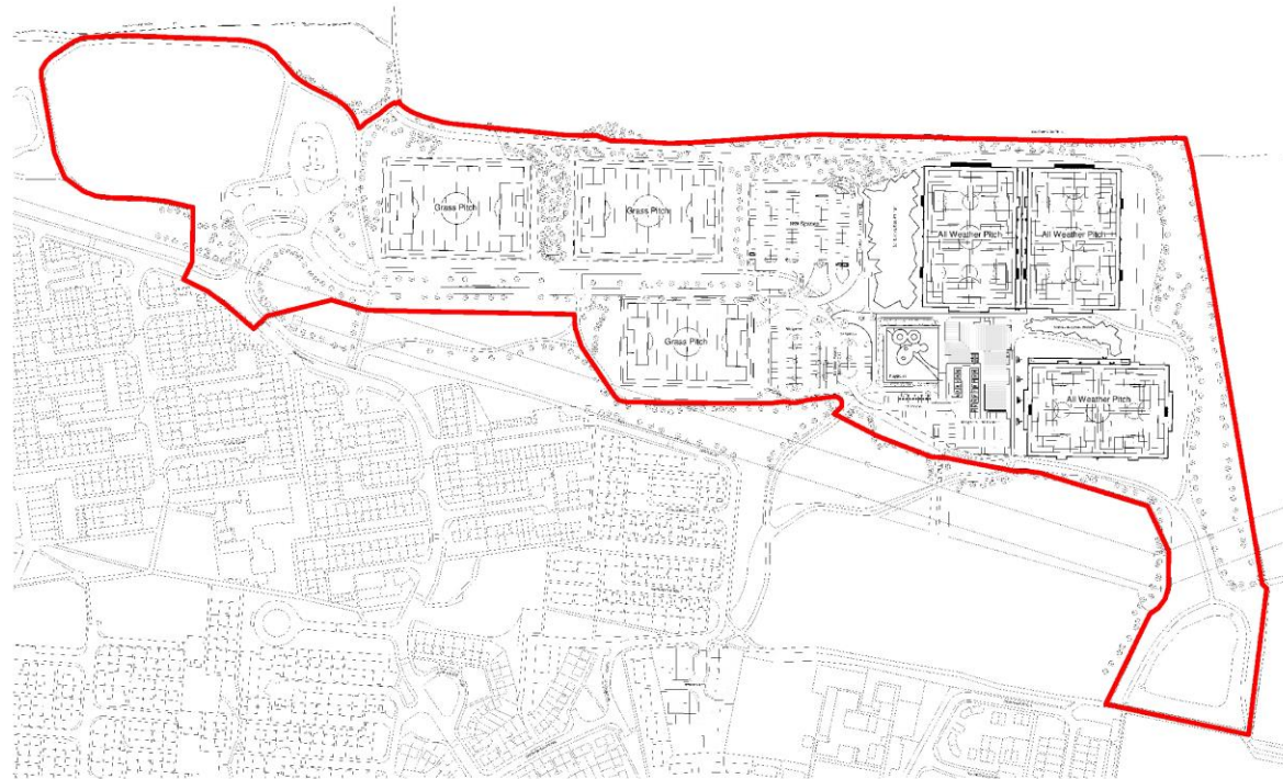
1 PROPOSED SITE PLAN (OVERALL) 1:1250