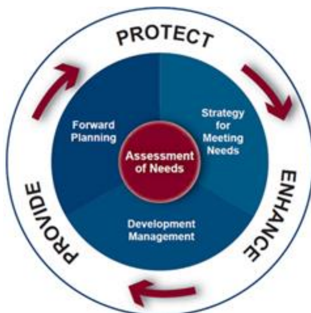
Figure 1: Sport England planning objectives - Protect, Enhance and Provide

To provide new playing pitches where there is current or future demand to do so