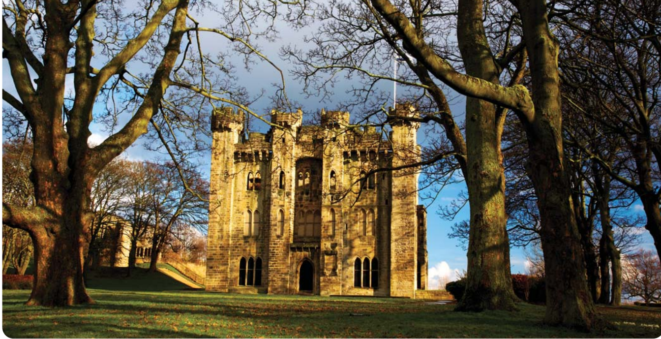
Hylton Castle