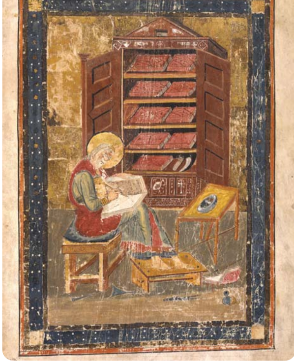
Illustration of Ezra, the Old Testament Scribe