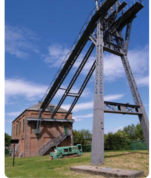
Washington F. Pit Museum

Sunderland has a rich and fascinating heritage and we are rightly proud of it. The city is changing and has new aspirations for a dynamic future. Heritage has a major part to play in Sunderland's on-going economic and social transformation.