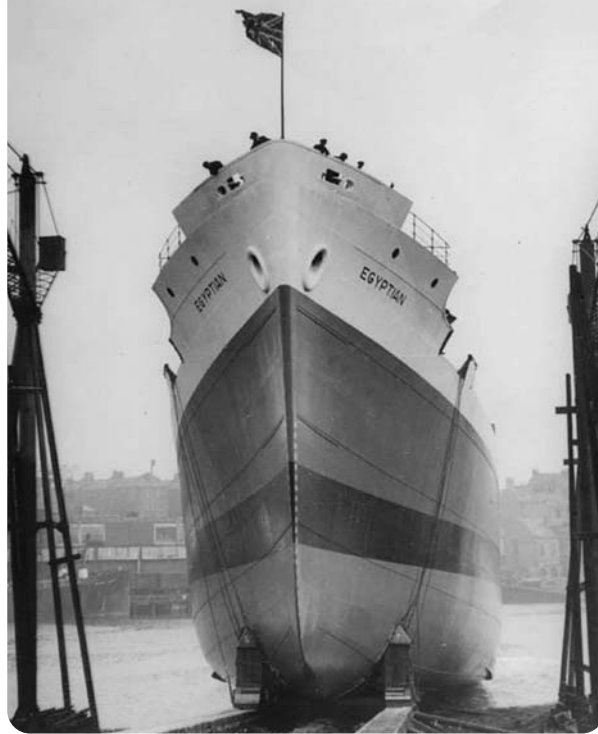
Shipbuilding on the River Wear