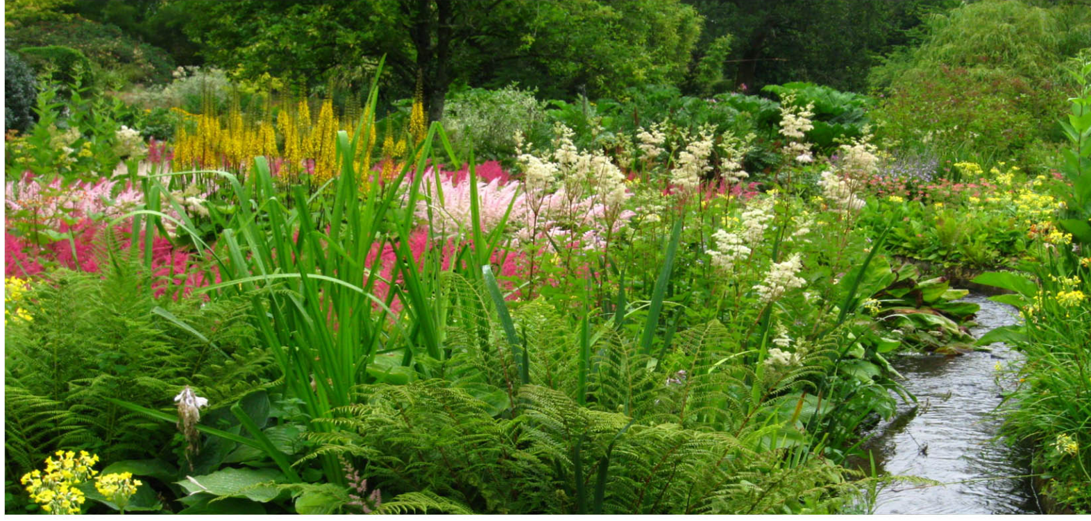
The bog garden will act as the heart of the park. It will generate a native plant ethos throughout the park. Creating a storage bank of native plants that can act as a nursery for aquatic wildlife. It will provide food for bees butterflies and insects.