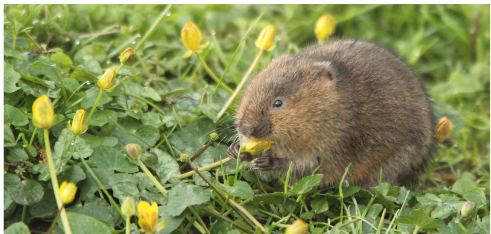
The wetland and bog garden approach will initiate an incentive to help with the deterioration of local wildlife. The water vole is the fastest declining mammal in the UK and our water ways are imperative to their survival. These and many other native species are under threat due to the loss of wetland habitat.