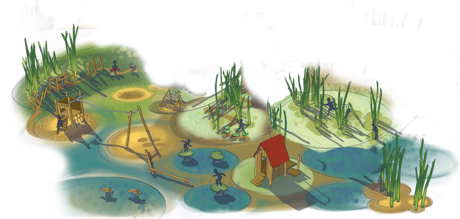
The toddler play will be made of natural wood, this example shows how a play area can allow the design to work harmoniously with the natural environment. The intention is for the toddlers to want to engage more the natural world.