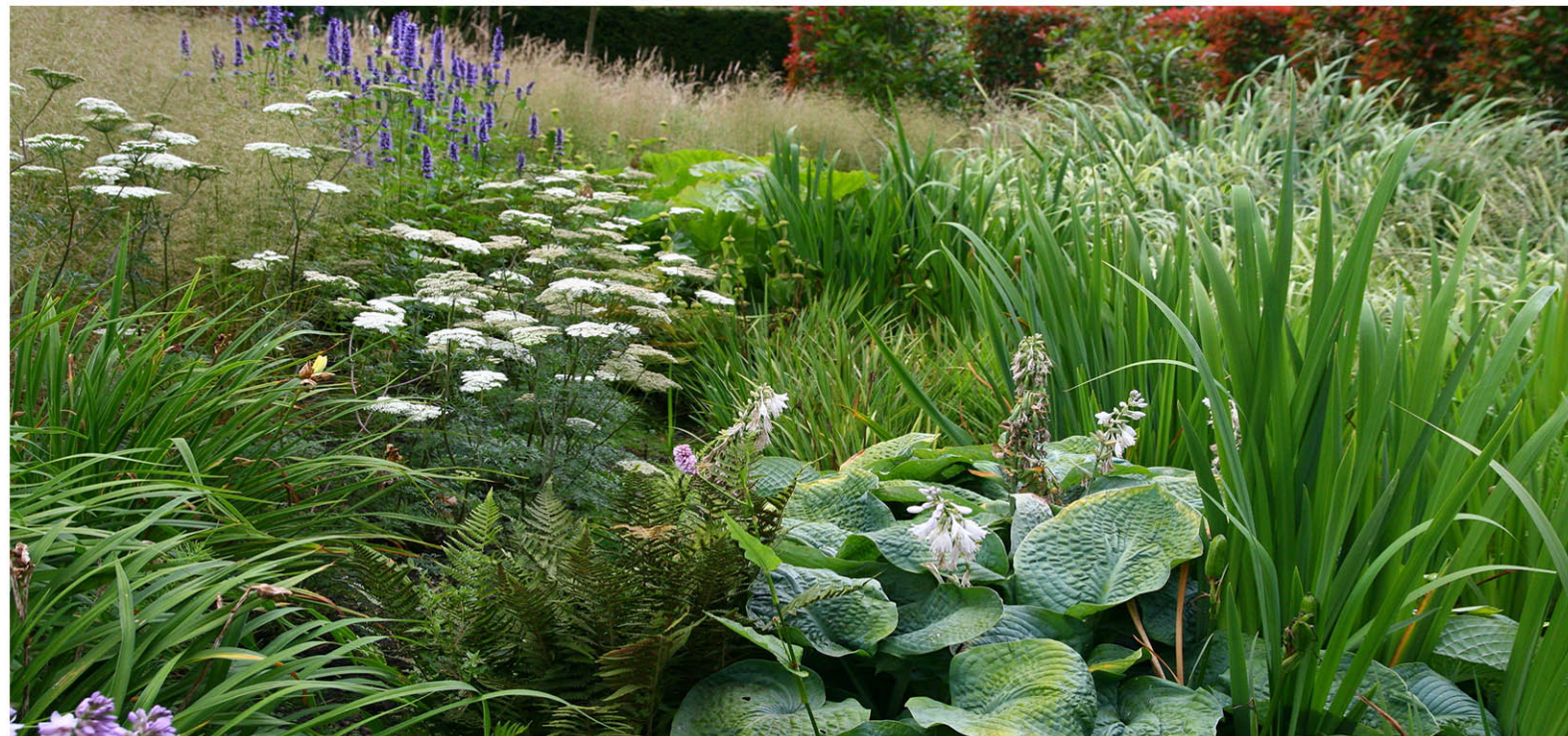
Plants like marsh marigold, yellow flag iris and bog-bean are multi-storey homes for many species, and provide shelter for their young. Each plant will be highlighted within the decked area with information boards giving the visitors valuable education about their surrounding environment.