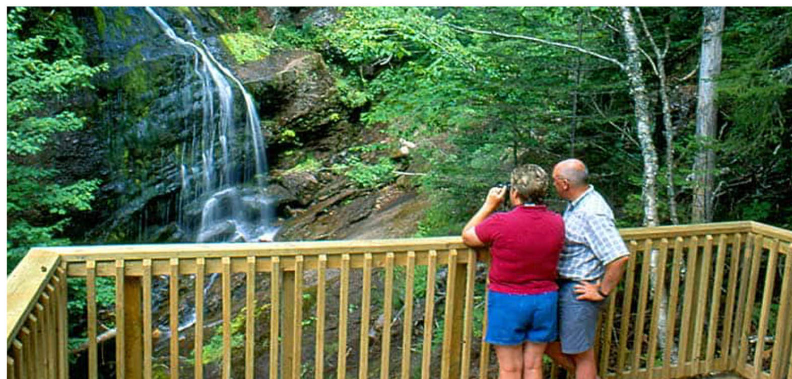
The woodland lookout area will encourage interest in the woodland on the other side of the burn. The increased maintenance will increase flora and fauna making these a perfect place to view these. Bird and bat boxes will be placed adjacent from this lookout to give the best chance of viewing these species.