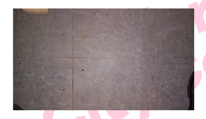
Item 10: As 253789-1

The Floor tiles (023/Toy Store) do not contain asbestos