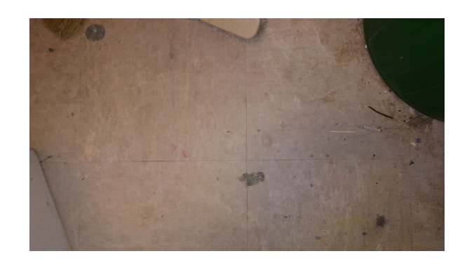
Item 9: 253789-1

The Floor tiles (023/Toy Store) do not contain asbestos