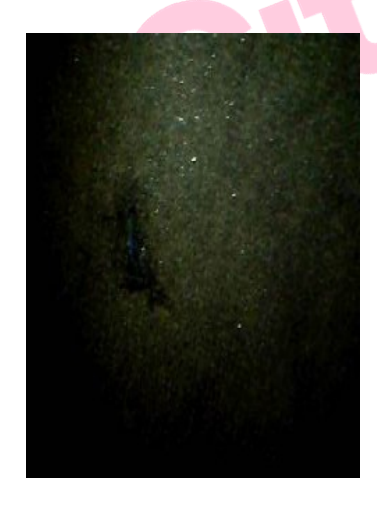
Item 5 - BB003033

The floor tiles to the Verandah store do not contain asbestos