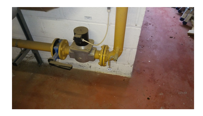
Item 12: 253789-5

The Gasket (036/Boiler Room) does not contain asbestos