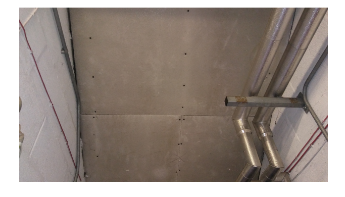
Item 11: 253789-4

The Floor tiles (024/Cupboard) do not contain asbestos