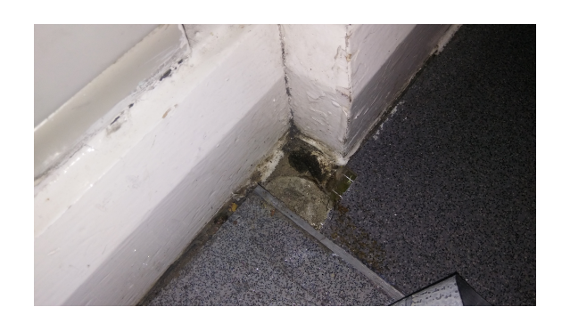
Item 45- Ref: 343959-1

The screed to the floor in Year 1 Classroom does not contain asbestos.