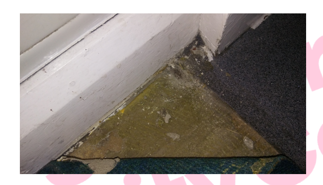
Item 46- Ref: 343959-1

The screed to the floor in Year 1 Classroom does not contain asbestos.