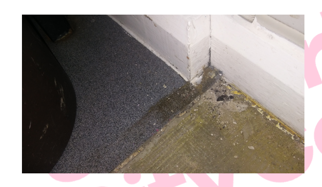
Item 43- Ref: 343959-1

The screed to the floor in Year 6 Classroom does not contain asbestos.