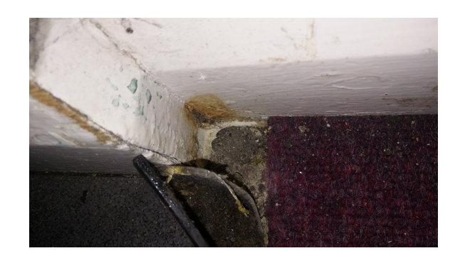
Item 42- Ref: 343959-1

The screed to the floor in Year 6 Classroom does not contain asbestos.