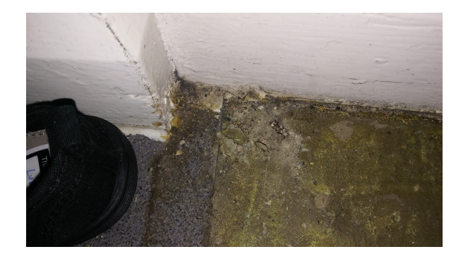
Item 44- Ref: 343959-1

The screed to the floor in Year 3 Classroom does not contain asbestos.