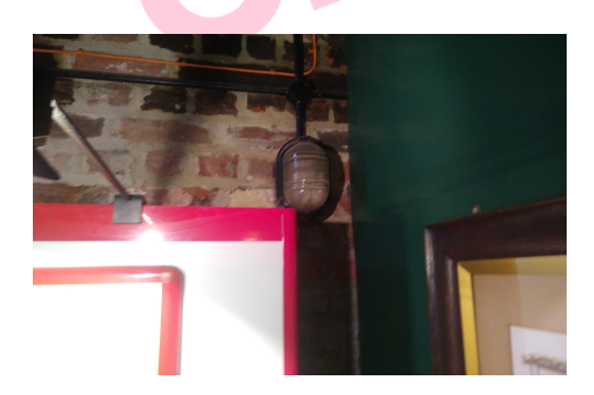
Item 3 Ref: 423190-1

Any change in its appearance should be recorded and reported to Property Services.