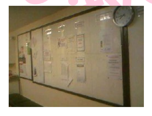
Item 9 - Ref: CB008865

Any change in its appearance should be recorded and passed to Property Services.