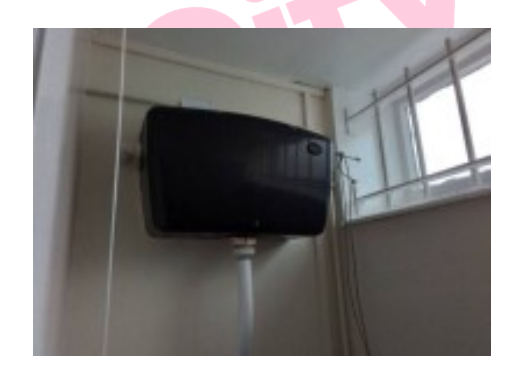
Item 3 - Ref: QY000252

Any change in its appearance should be recorded and passed to Property Services.