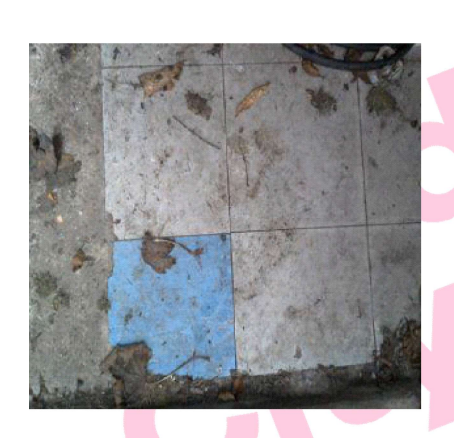
Item 6 - Ref: FB000134

The vinyl flooring to the shed (Room 1) contains asbestos.