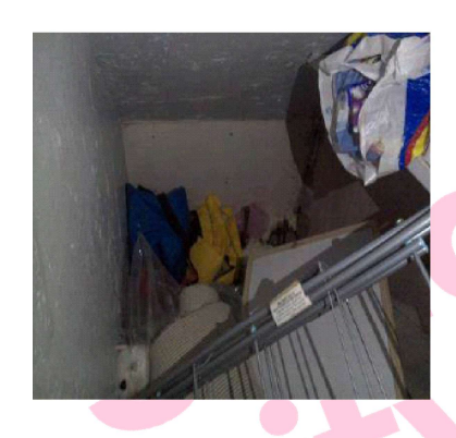
Item 3 - Ref: Presumed

The ceiling to the hall (Room 3) does not contain asbestos.