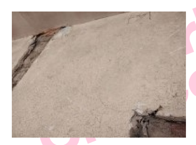
Item 21 - Ref: KX001936

The wall coating from around the door and lintel in the outhouse (External E/006) contains asbestos.