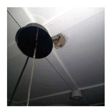
Item 2 - Ref: FB000132

The ceiling to the hall (Room 3) does not contain asbestos.