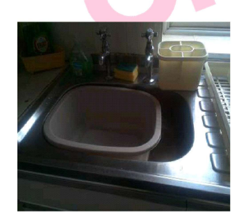
Item 9 - Ref: FC001319

South Lodge - Do not use - please refer to Care and Support register for further information