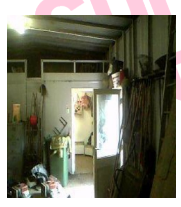
The mess room (rooms 1 and 2) were accessed and no suspect materials were found.

The roof tiles to the external of the building do not contain asbestos. There was no access to the steeple due to its height.