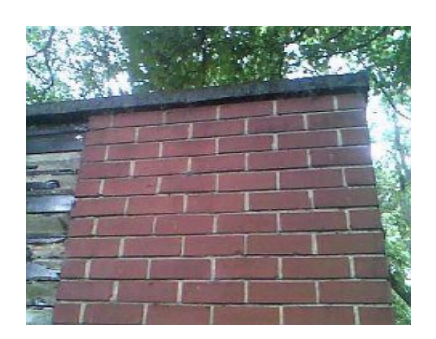
Item 8 - Ref: BB005402

The roof felt to the external of the toilet block does not contain asbestos.