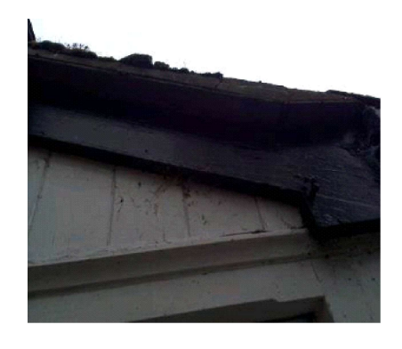
Item 7 - Ref: FB000134

Any change in its appearance should be noted and passed to Property Services.