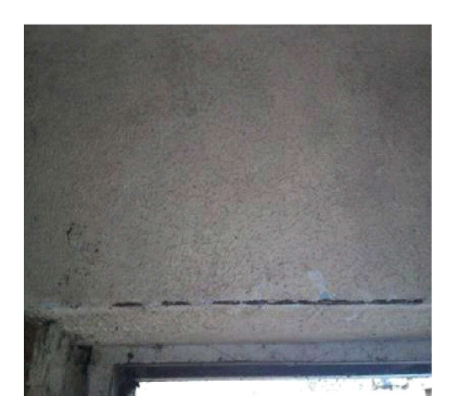
Item 4 - Ref: FB000133

The panel to the insulation board in the cupboard under the stairs (Room 4) does not contain asbestos.