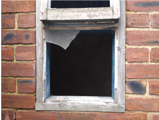
Item 16 Ref: 403295-10

The putty to the windows in the external wc (Rm 0/006) does not contain asbestos.