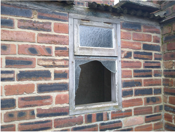
Item 19 Ref: As 403295-10

The putty to the windows in the external wc (Rm 0/007) does not contain asbestos.