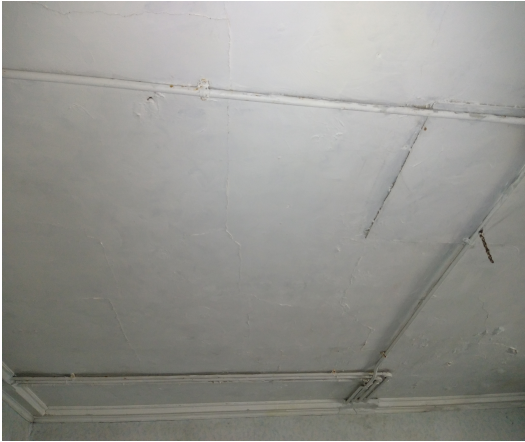
Item 10 Ref: 403295-7

The decorative finish to lath and plaster ceiling in the living room (Rm 0/003) does not contain asbestos.