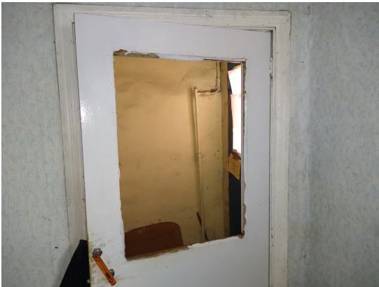
Item 11 Ref: 403295-11

The decorative finish to lath and plaster ceiling in the living room (Rm 0/003) does not contain asbestos.