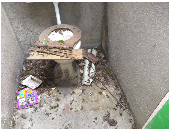
Item 18 Ref: As 403295-9

The cement debris to floor in the external wc (Rm 0/007) does contain asbestos.