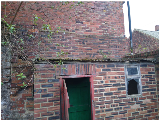
Item 17 Ref: As 403295-9

The putty to the windows in the external wc (Rm 0/006) does not contain asbestos.