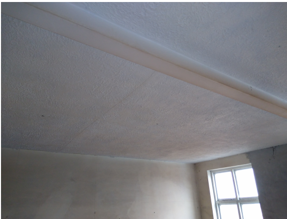
Item 20 Ref: 403295-12

The putty to the windows in the external wc (Rm 0/007) does not contain asbestos.