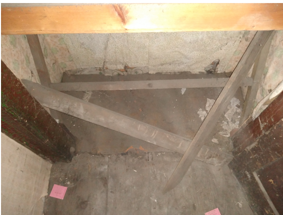
Item 12 Ref: 403295-8

The putty to door in the living room (Rm 0/003) does not contain asbestos.