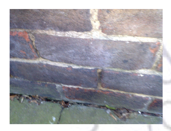
Item 13 - Ref: NO09/4037

The soffit boards to the external do not contain asbestos.