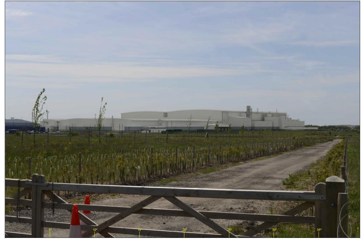
Figure 3 Proposed revised buildings

Viewpoint B, IAMP One Phase Two Development s73 Variation Application