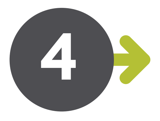
Submit and Examination in Public