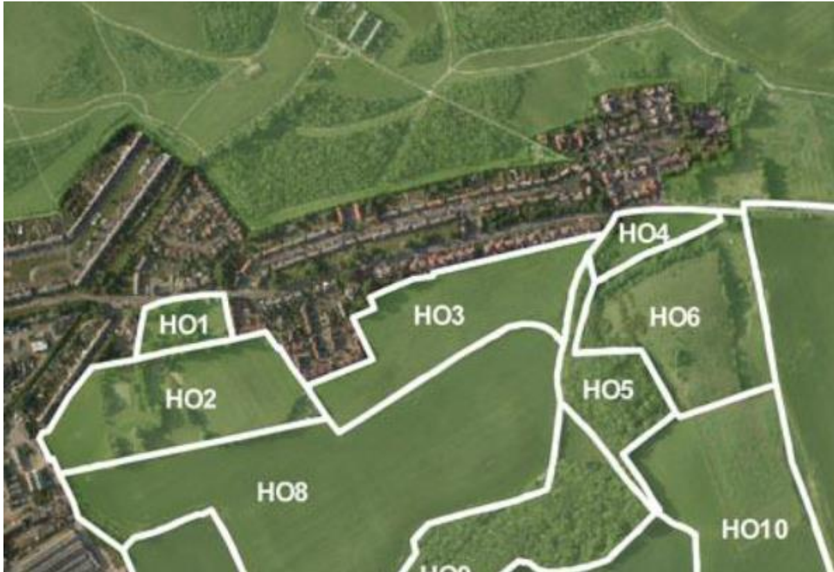
Figure 1 - Site Ref. HO3 - extract from Green Belt Assessment Stage 1 Updated and Stage 2 (2017) (SD.30)