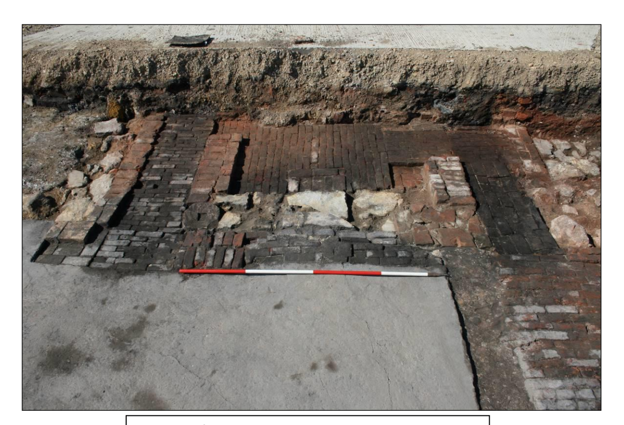
Annealing furnace working area