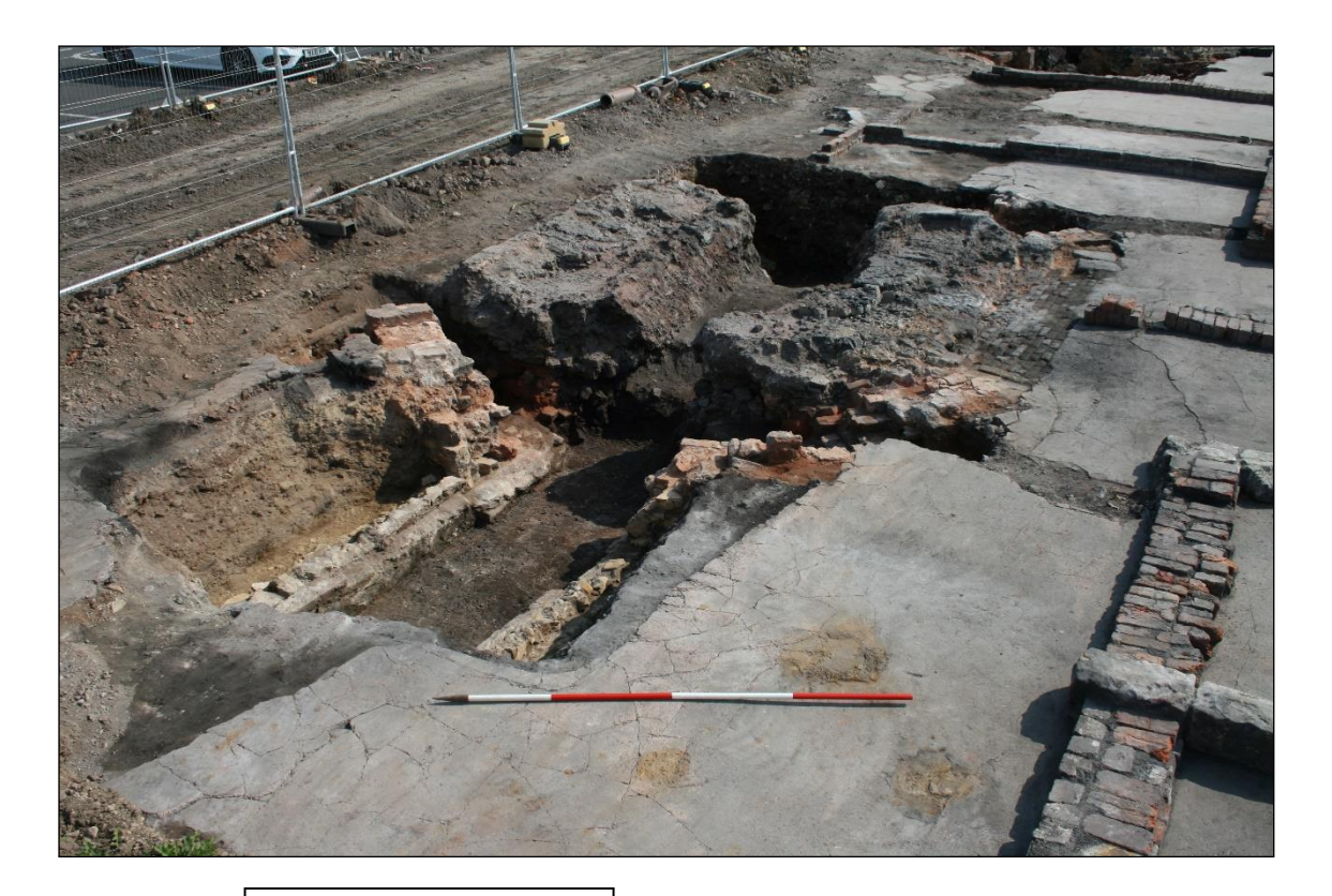
Northern glass cone