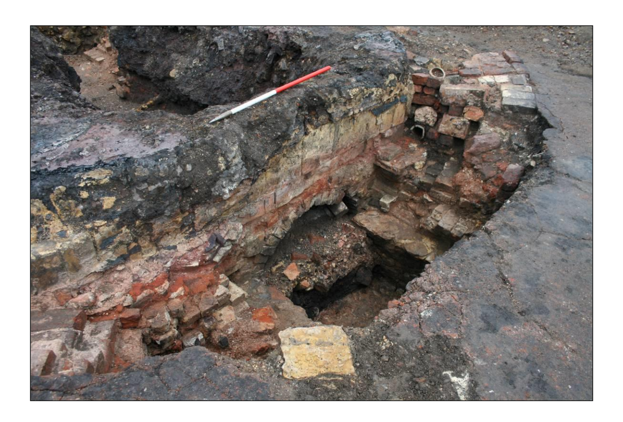
Southern glass cone with arched flue entrance