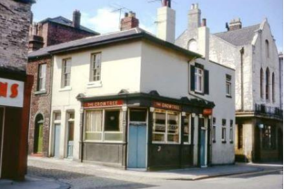
Image 1 – Early photograph of Crowtree Inn in the late 19<sup>th</sup>/early 20<sup>th</sup> century