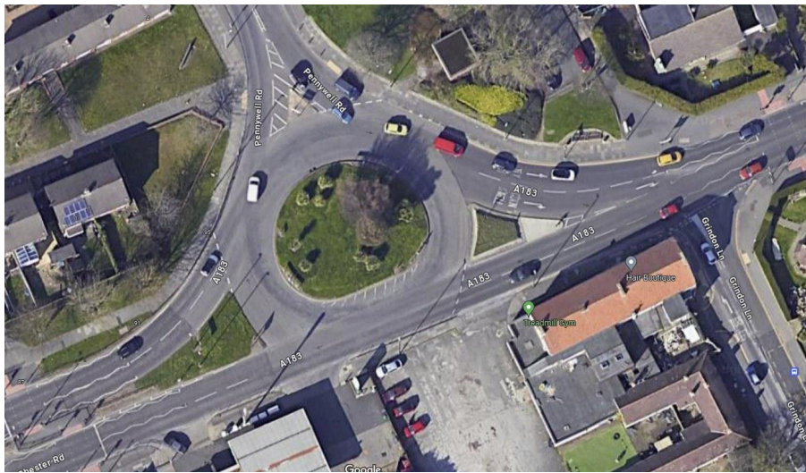
11 - A183 Roundabout junction with Pennywell Road