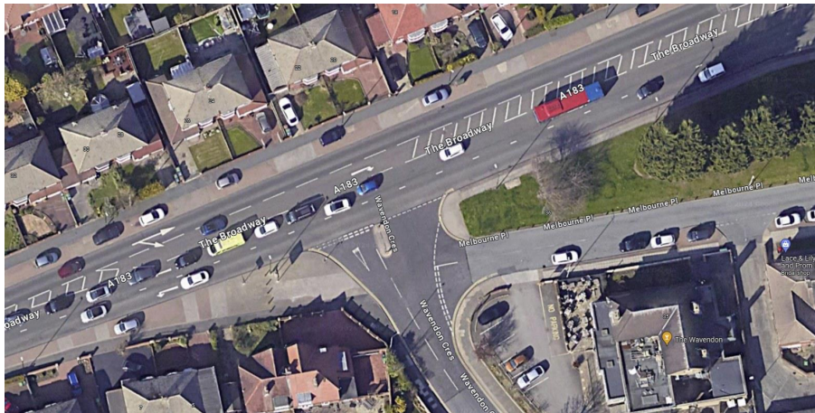
12 - A183 at the junction of Wavendon Crescent