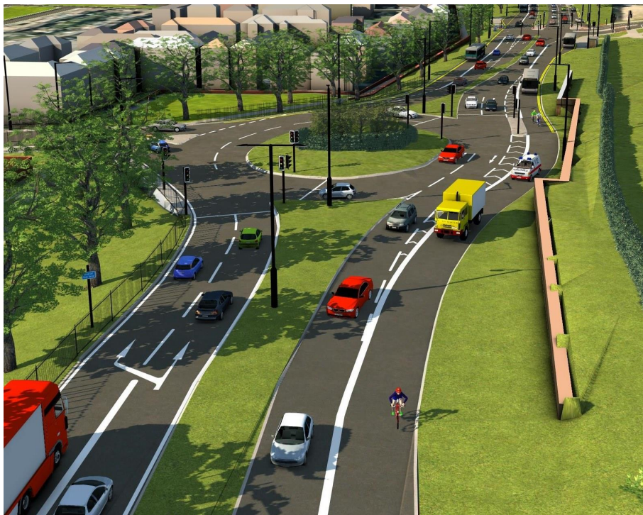
9 - Greenwood Road Roundabout (East to West)