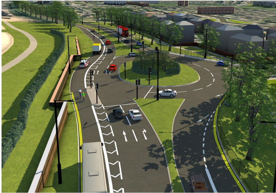
10 - Greenwood Road Roundabout (West to East)