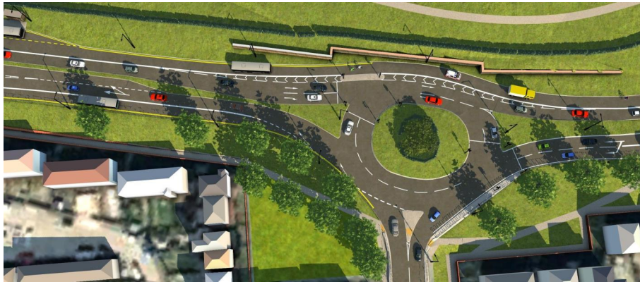
8 - Greenwood Road Roundabout (Overview)