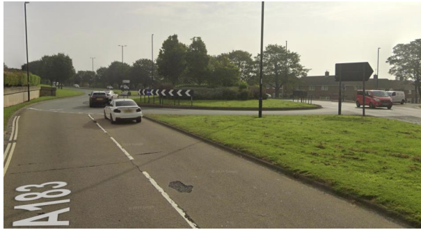
7 - A183 Roundabout junction with Greenwood Road