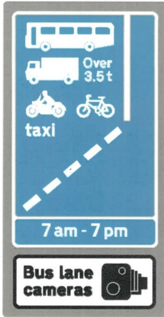
1 - Proposed Sign Showing Permitted Vehicles in Bus Lane