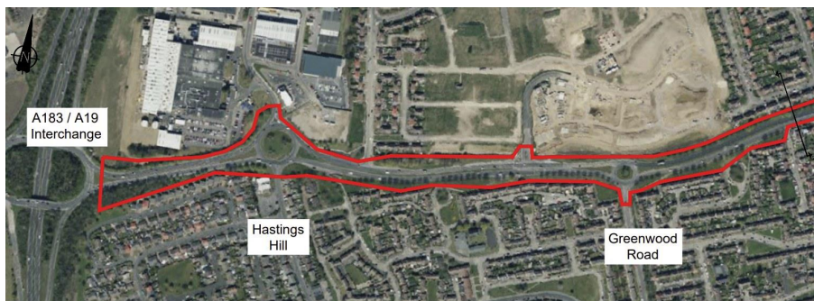
2 - Bus Lane Extents - West