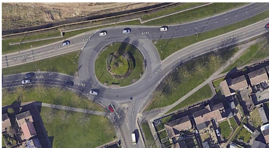
6 - A183 Roundabout junction with Greenwood Road