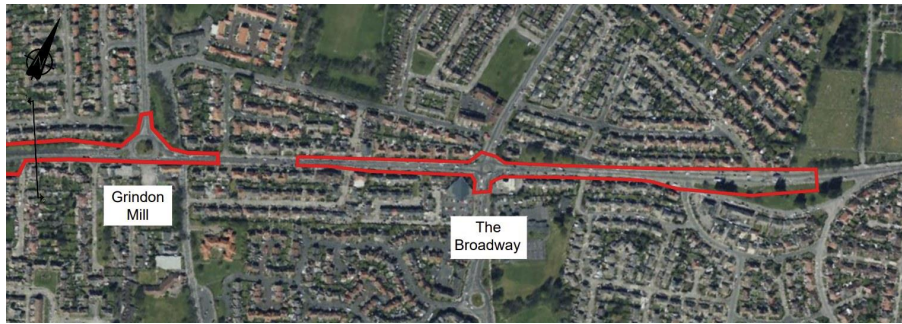
3 - Bus Lane Extents - East